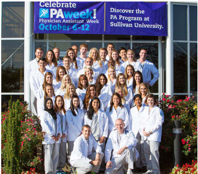
SUPAP Students - PA Week